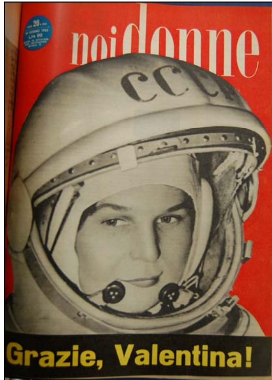
1963 cover of Noi Donne , thanking Valentina Tereshkova, the first woman cosmonaut

reaches the sky and represents the most beautiful and fantastic proof of technical progress and of man's intelligence, it seems incredible and absurd that some bureaucrats keep imposing to women a useless exertion, sign of outdated times and customs".